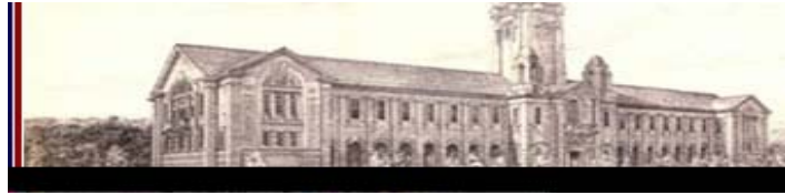
Indian Institute of Science (IISc), Bangalore

“If the Sudra intentionally listens for committing to memory the Veda, then his ears should be filled with (molten) lead; if he utters the Veda, then his tongue should be cut off.” – Manusmriti